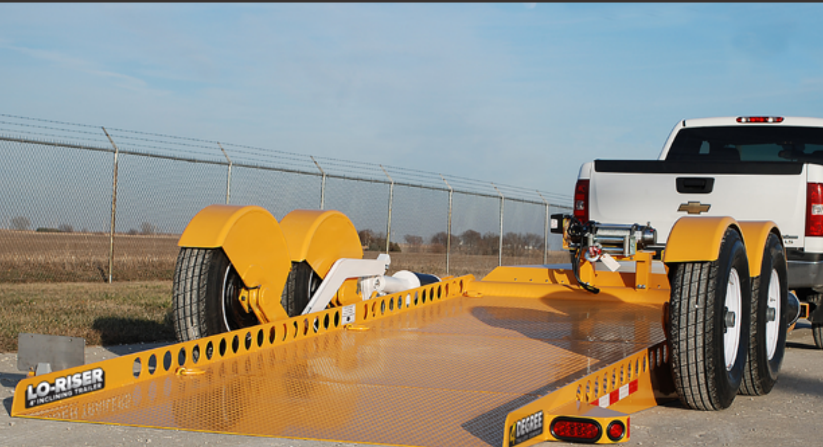
Lo Riser Model Shown