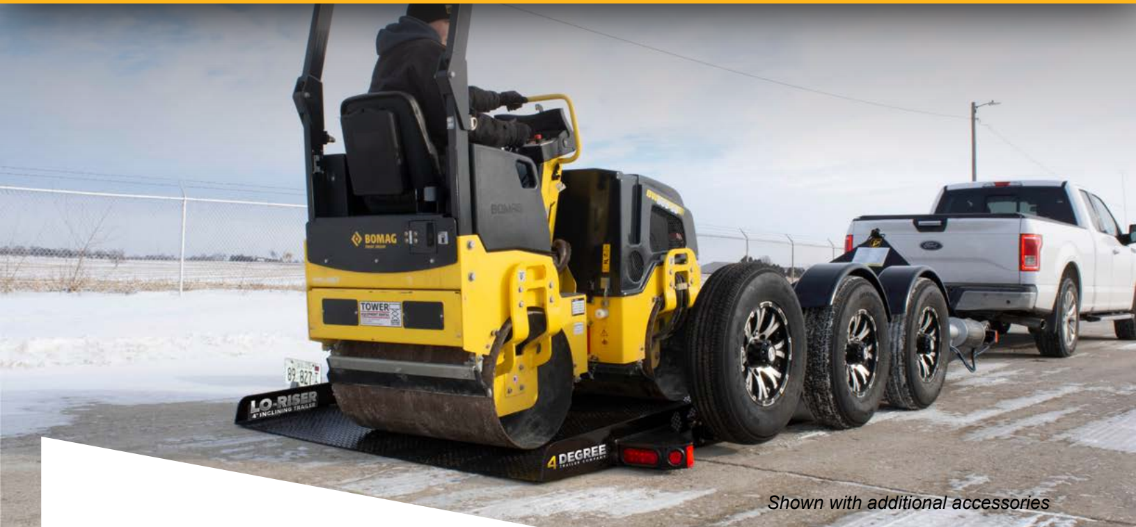
Shown with additional accessories