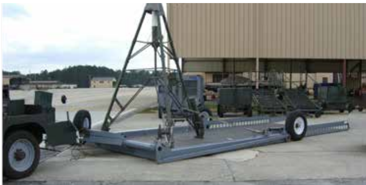
Secure Payloads - Integrated Tie-Down Rails, Plus 6 "D" Rings.