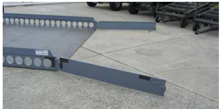
Easy Loading - 3/16" lip and a 3-Degree Loading Angle Plus, Payload Gate with Locking Pin.