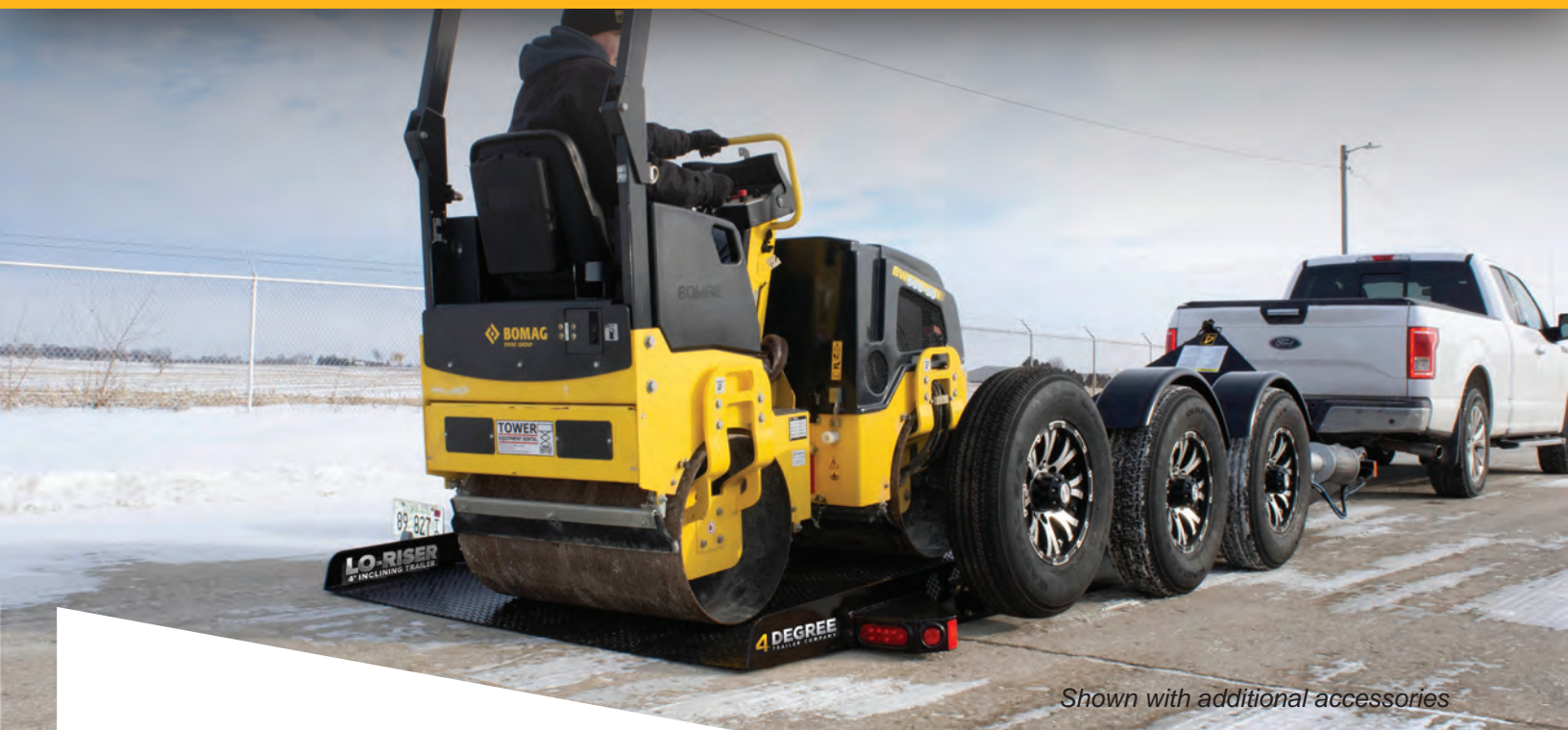
Shown with additional accessories